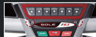
Sound System with Audio-in and Out Jacks

The F63 console is user friendly with a vibrant blue display. The information that is displayed at all times includes Speed, Incline, Time, Distance Traveled, Calories, Pulse and Pace. There is also a 1/4 mile track feature and a Peak and Valley graph for different programs.