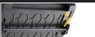
Easy Assist Folding

The strong, 3.5 Continuous Duty HP motor delivers challenging speeds up to 12 mph and inclines up to 15 levels. And when not in use, the treadmill deck safely locks into place, 100% secured.