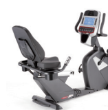
LCR LIGHT COMMERCIAL