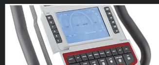
Vibrant Blue LCD Display

With a comfortable supportive seat that adjusts to users' needs, you can focus less on being uncomfortable and more on getting in shape. Statistics show that people are more likely to stick to a routine on a recumbent bike than other forms of exercise.