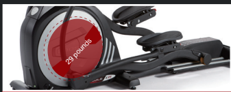
whisper-quiet Drive System

E35 is rated as a "Best Buy" from numerous consumer websites and "The Best Buy" from leading consumer magazines for its quality and value. This model has a user friendly console with blue backlit LCD display. Added perks include built-in cooling fan, water bottle holder, and built-in speakers allowing users to hook up any music device.