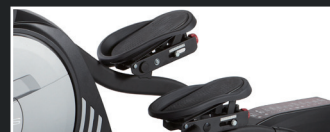
Custom Designed Foot Pedals

by Treadmill Doctor The Nation's Trusted Source For Fitness Equipment