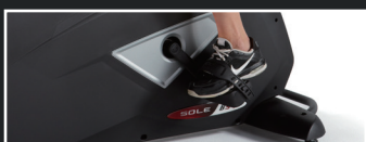
Uniquely Designed Foot Pedals

The adjustable gel seat, strong frame, and ergonomically designed pedals allow the machine to conform its movement to you instead of the other way around.