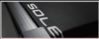
Large Running Surface

The F60 treadmill is one of the newer additions to the SOLE lineup. SOLE has always prided itself on the quality and value of our machines. We are confident that the F60 is well on its way to becoming another best seller.