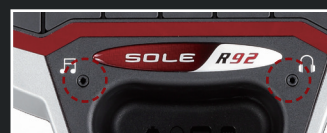
Sound System with 2 Way Cable

Our integrated 9" LCD display, with customizable programs, is the spotlight of this model. If you are looking for challenge, preset programs such as Hill, User Defined feature, or Heart Rate Control will add excitement to your workout routine.