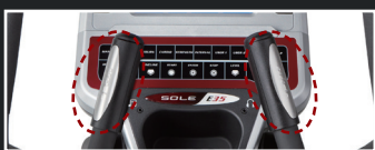
Stationary Handle Bars

The whisper-quiet drive system provides fluid, natural motion. The combination of a heavy 29 lb. flywheel and a high gear ratio, not found on comparable models, renders the utmost smoothness with plenty of resistance for a challenging workout.