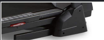
PRECISELY Welded Frame

Along with design values, the F60 comes with 10 standard programs and a very detailed, informative display console, which will provide users with beneficial feedback during and after workouts.