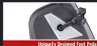
Uniquely Designed Foot Pedals

Recumbent bikes are becoming the latest trend in the exercise world because getting a great workout has never been so comfortable. The market has proven to respond to SOLE's recumbent designs especially for its relaxing position and low impact - an extremely important consideration when choosing fitness bikes. Users with foot and joint issues will love our R92.