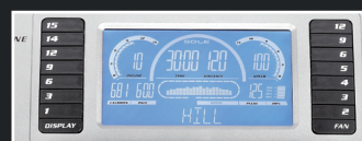
Heart Rate Control

The TT8 treadmill has the same great Cushion Flex Deck that other SOLE models have to minimize impact to hips, knees and ankles.