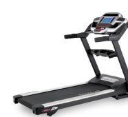
TT8 LIGHT COMMERCIAL