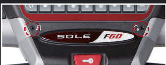
Sound System with Audio-in and Out Jacks

Accurate and precise welding is important when designing a treadmill. Durability of a product begins with a strong frame, capable of handling multiple users of various weights and heights.