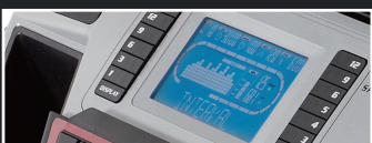
Vibrant Blue LCD Display

The console runs up to six preset programs, two customizable workout programs and two heart rate programs. Other safety features include a large stop switch, starting from only in 0.5 mph and a low-profile running hood.