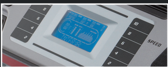
Specialized Workout Programs

F60 is equipped with a large 20" x 60" running deck with cushion flex suspension and a strong 2.75 chp motor and easy-assist folding design.