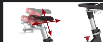
Adjustable Seat and Handlebars

For indoor cycle enthusiasts, comfort is extremely important. The adjustable seat and handlebars move vertically and horizontally, allowing a user to find just the right settings for a great workout.