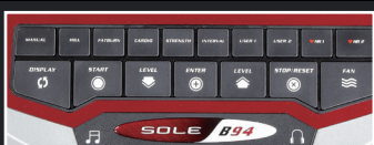
Specialized Workout Programs

The B94's straightforward buttons and 9" LCD display will also provide users with fast, effective fat-burning cardio exercises. You will spend less time on gimmicky interface and more time on reaching your goals.