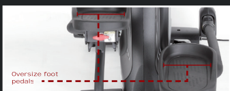
Oversized Foot Pedals

There are built-in heart rate sensors on the stationary handles. Additionally, a separate chest strap is included for the same monitoring for interactive programs.