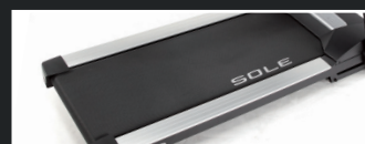
Oversized Running Surface

TT8 offers a grated reinforced framework, perma-waxed reversible deck, with 3" crowned rollers, which offer any runner uncompromising quality for years and years of use. When compared to other models, the SOLE TT8 is miles ahead of the competition in quality, performance, and value.