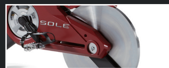
Commercial Grade Flywheel

The gel seat is a critical feature for enhanced comfort at home, and certainly essential for professional cycling. Gel seats lessen pressure significantly.