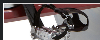
Oversized Foot Pedals

A heavy duty 48 lb. chrome plated flywheel and Kevlar breaking design will guarantee a quiet and smooth ride.