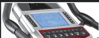
Vibrant Blue LCD Display

Our patented 2 degree inward design on our foot pedals puts your body in its correct posture, minimizing the aches and pains that other manufacturers' models may cause.