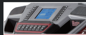
Specialized Workout Programs

The strong, 3.0 Continuous Duty HP motor delivers challenging speeds up to 12 mph and inclines up to 15 levels. And when not in use, the treadmill deck safely locks into place, 100% secured.