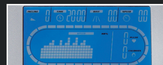
Vibrant Blue LCD Display

The console runs up to six preset programs including cardio training and fat burning specific programs. Other safety features include a large stop switch, starting from only in 1.0 mph and a low-profile running hood.