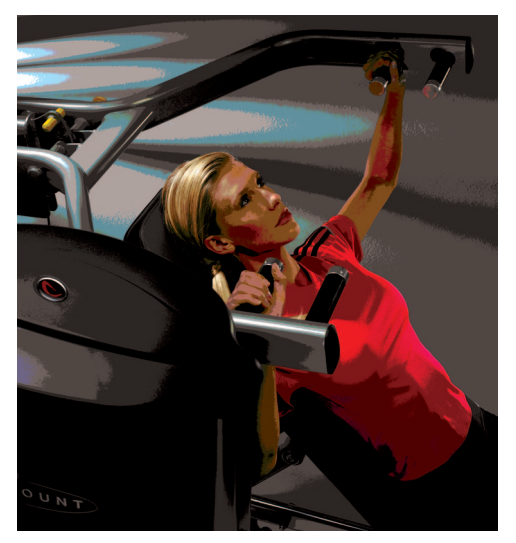
Value and performance from Paramount, a company dedicated to serving the fitness industry for more than 55 years.

Fitness Line is the perfect choice for hotels and resorts, corporate fitness centers, police and fire agencies, apartment and condominium complexes, personal training studios or any facility where space and budget are limited.