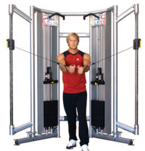
CHEST & BACK